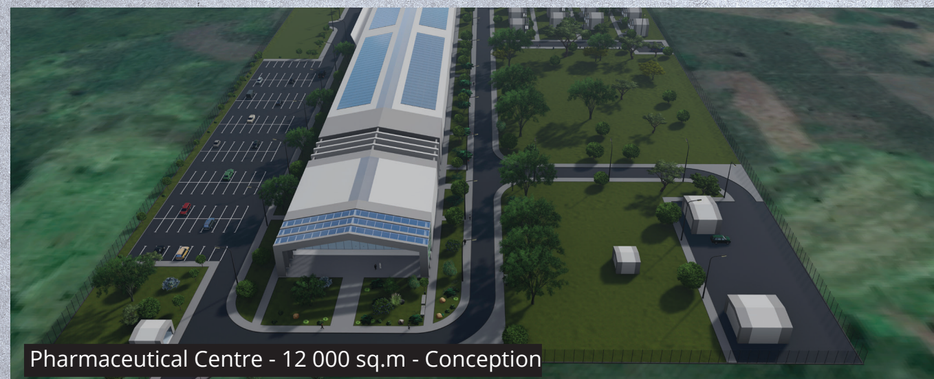
Pharmaceutical Centre - 12 000 sq.m - Conception

We carry out work projects in different countries of the world. Thanks to this our projects have modern technological solutions. BIM-designing moves forward construction technologies and adds value to the site. This technology allows us to predict and control the costs of a project, make changes quickly, combine many specialists in a single model, and assist in the operation of buildings.