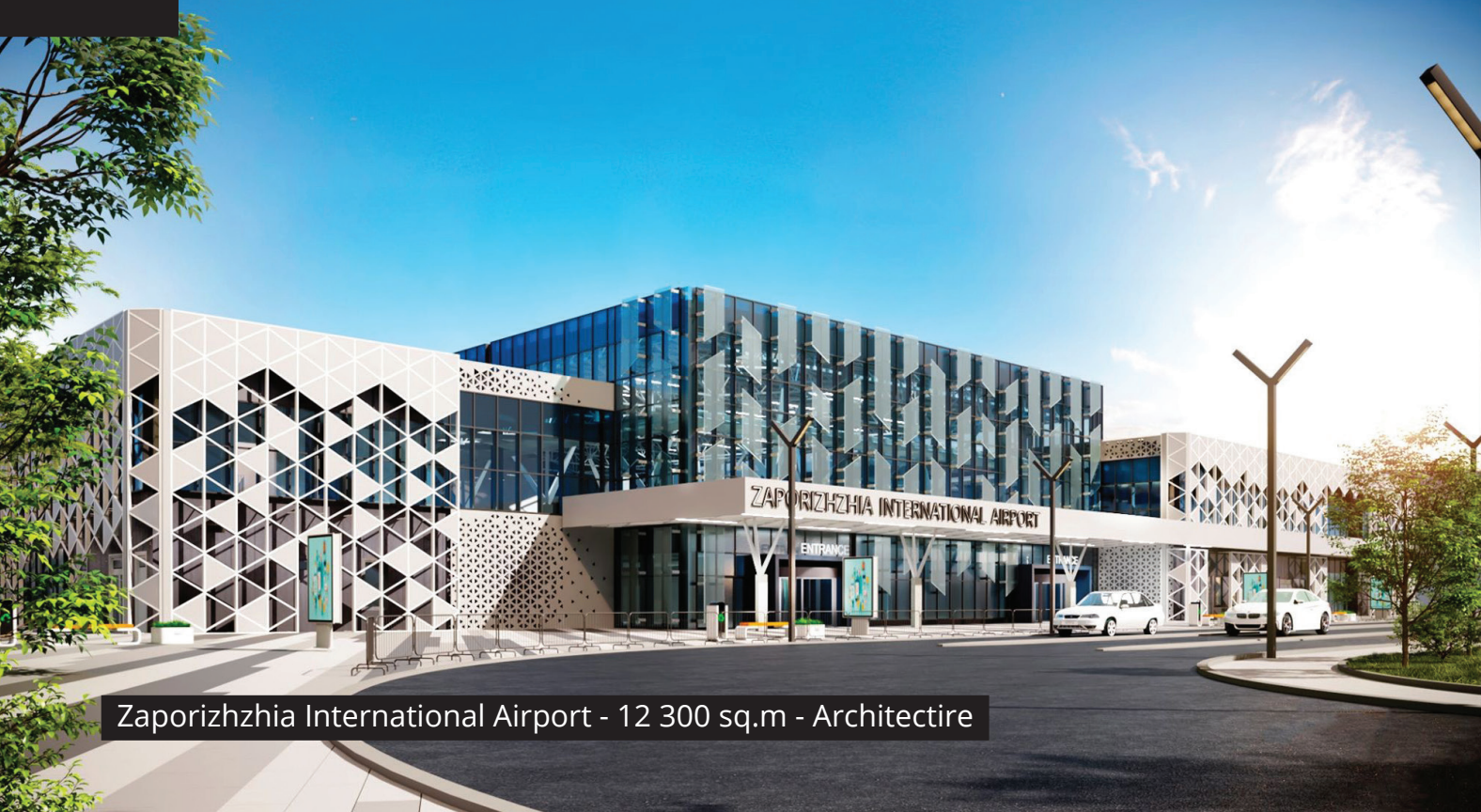
Zaporizhzhia International Airport - 12 300 sq.m - Architectire