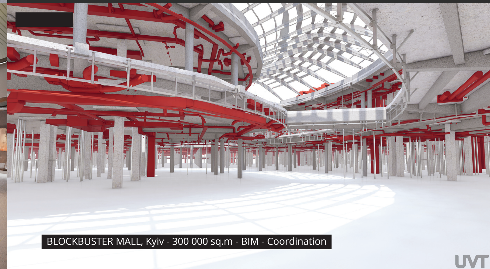
BLOCKBUSTER MALL, Kyiv - 300 000 sq.m - BIM - Coordination