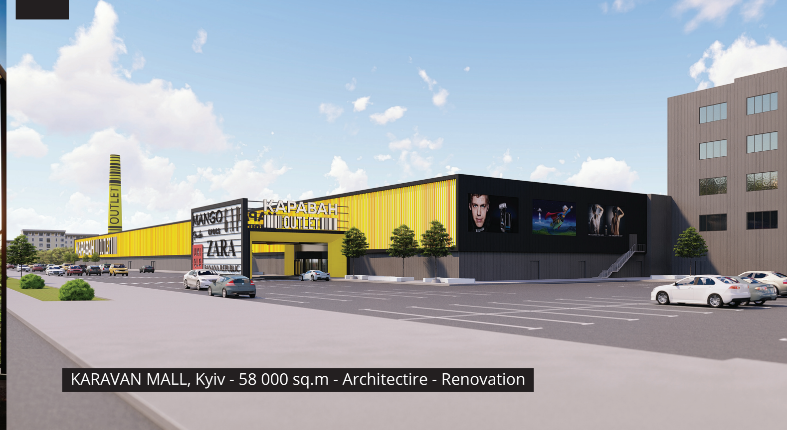
KARAVAN MALL, Kyiv - 58 000 sq.m - Architectire - Renovation