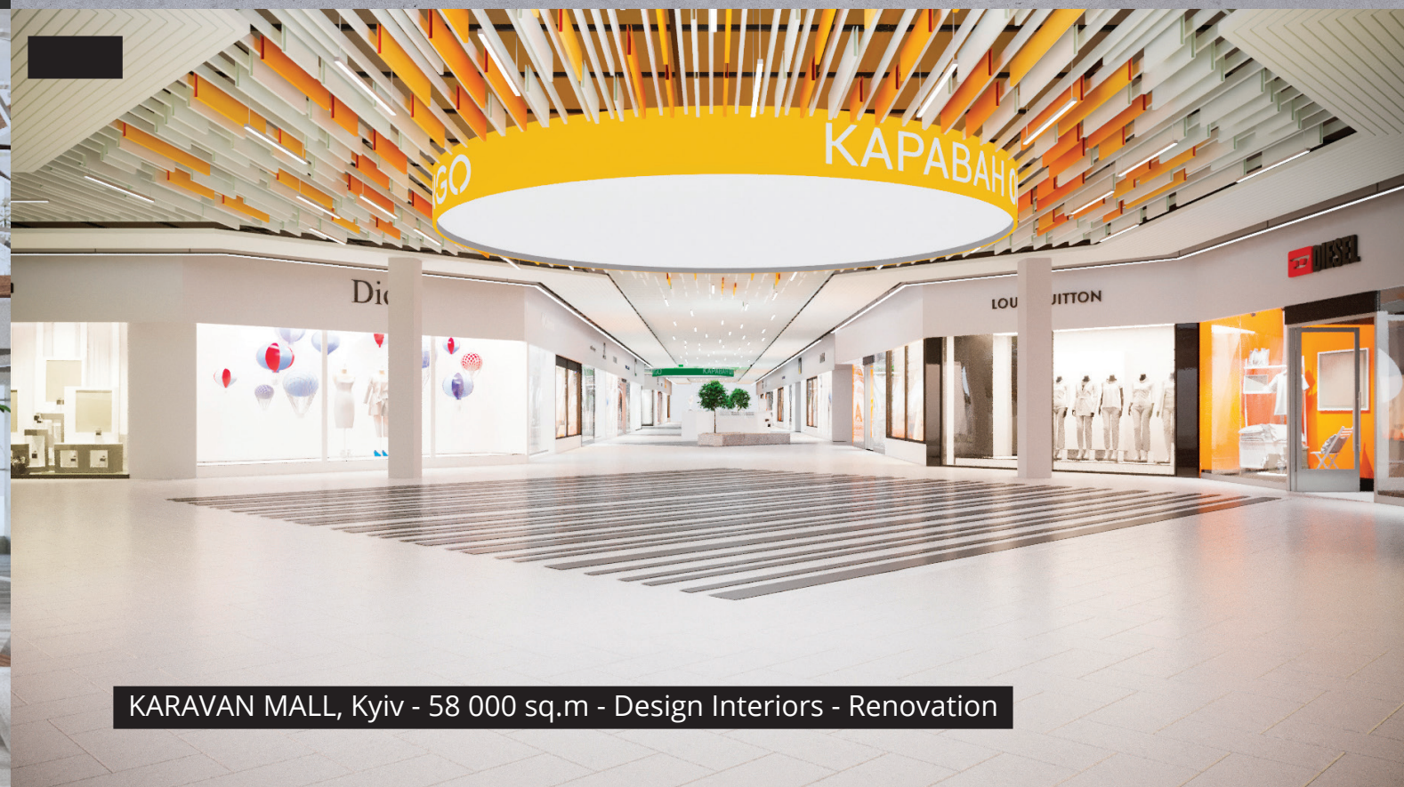
KARAVAN MALL, Kyiv - 58 000 sq.m - Design Interiors - Renovation