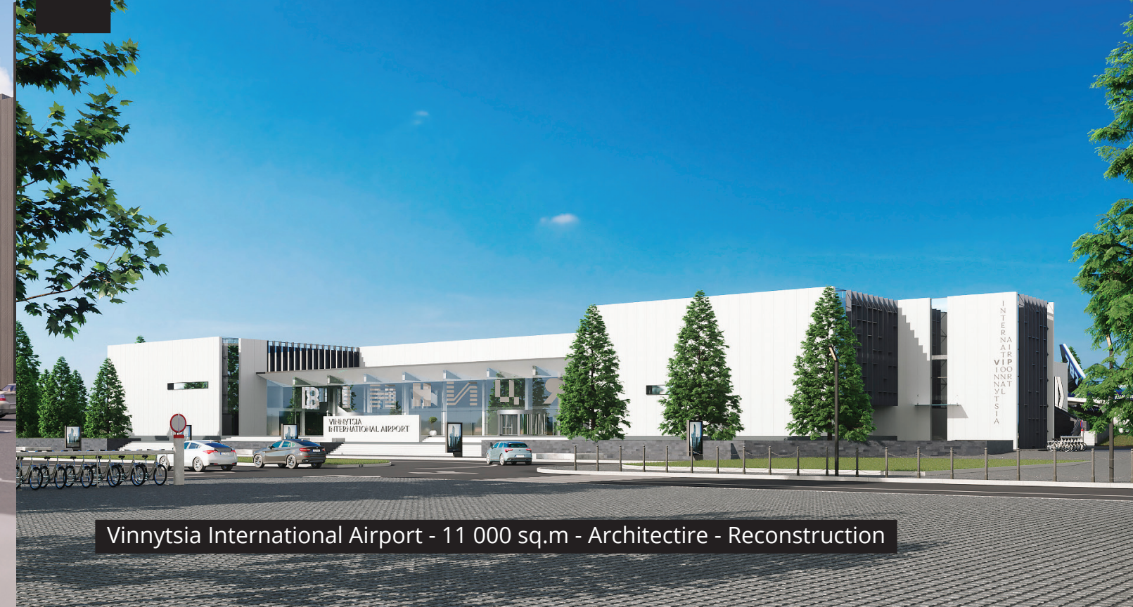
Vinnytsia International Airport - 11 000 sq.m - Architectire - Reconstruction